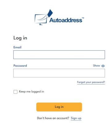
Step 5: Select the <u>Log in</u> button to bring you to your Dashboard.